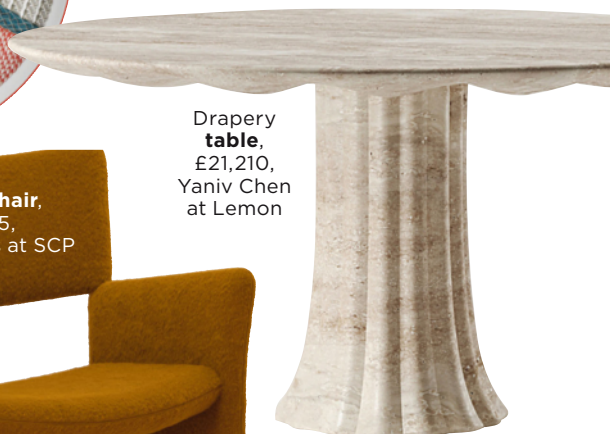
Drapery table , £21,210, Yaniv Chen at Lemon