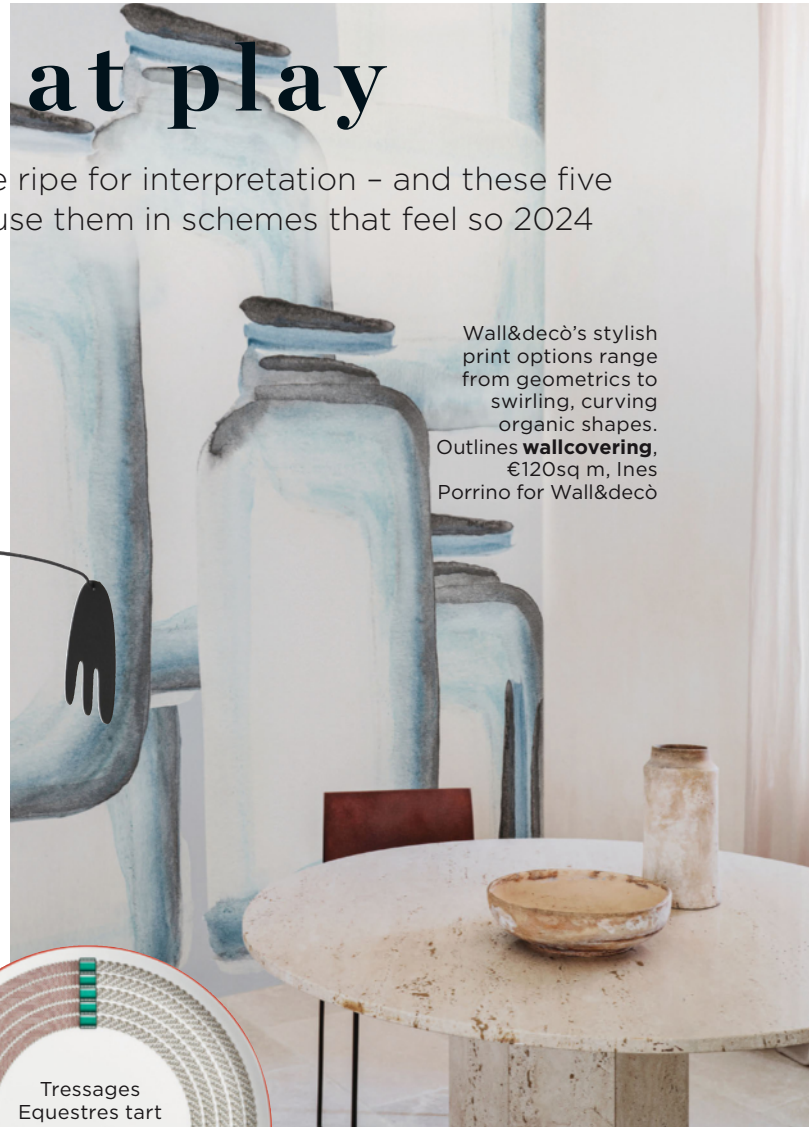
Wall&decò's stylish print options range from geometrics to swirling, curving organic shapes. Outlines wallcovering , €120sq m, Ines Porrino for Wall&decò