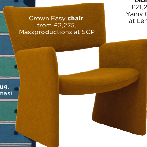
Crown Easy chair , from £2,275, Massproductions at SCP