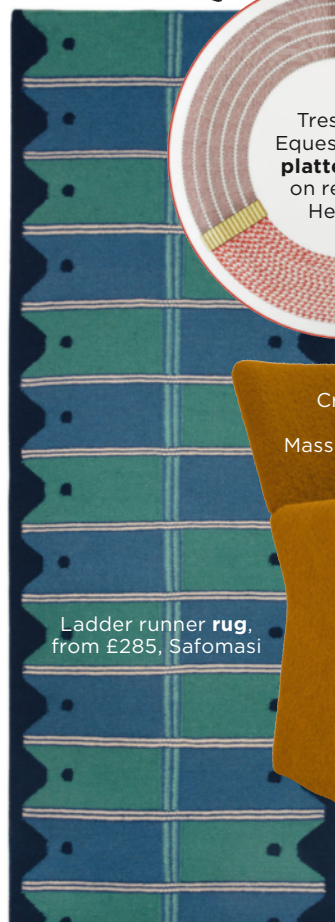
Ladder runner rug , from £285, Safomasi